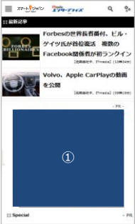
Top & Article Page

Smart Japan provide readers with “Smart Phone View” which has optimized layout for smart phone.